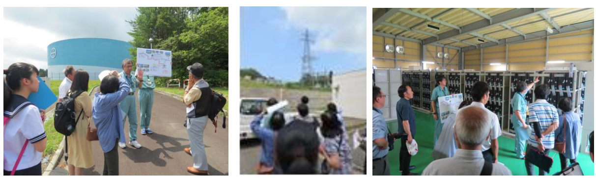
Fig. 3 The Akita University Open Lecture Field Visit