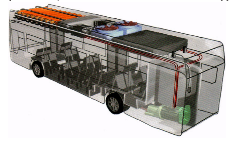
Figure 3 A Daimler-Chrysler Bus Powered by Hydrogen Fuel Cell in Reykjavick, Capital of Iceland

As for powering the large Icelandic fishing vessels there are in principle no obstacles provided that fuel cells in the megawatt range become com-