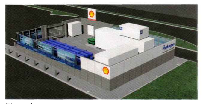
Figure 4 The World's First Commercial Hydrogen Filling Station Reykjavic, Iceland

Electricity Generation in Iceland, 2005-2006 Source: Energy Statistics in Iceland, 2007.