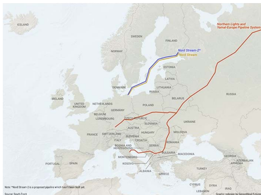
Map 4. Major Gas Pipelines between Russia & Germany

alliances and the rise and fall of the international importance of particular countries will change in accordance with the energy supply routes.