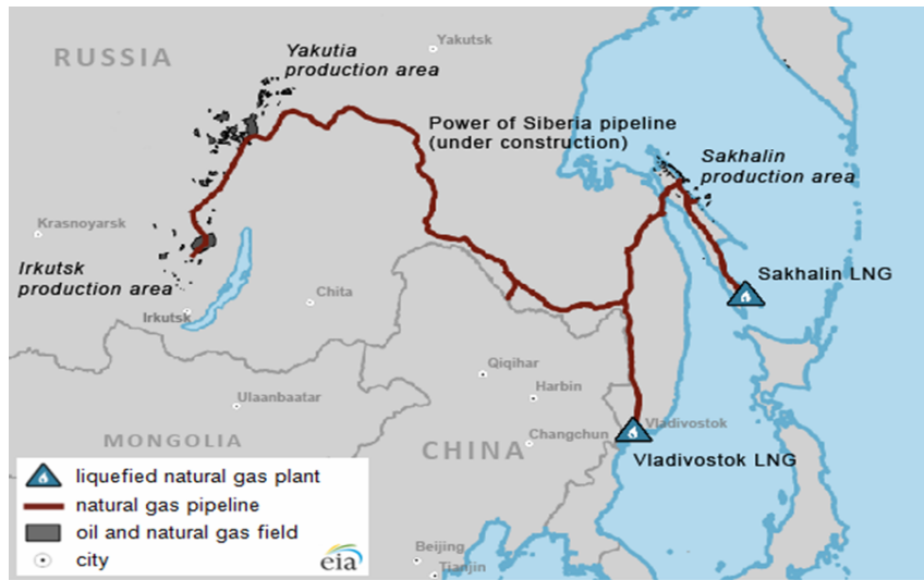
Map 3. The Power of Siberia Gas Pipeline. Selected natural gas infrastructure in eastern Russia.

The reality of the 21st century—as Putin sees it—is that energy is a political instrument. Political