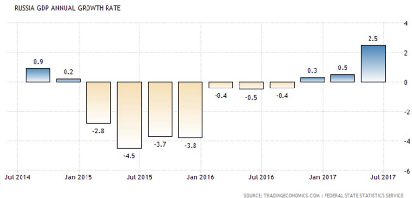
Chart 1. Russia GDP Annual Growth Rate