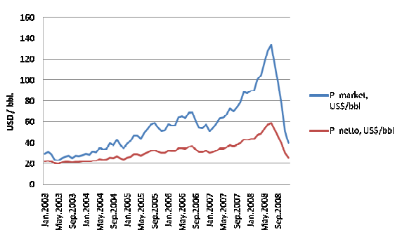
Figure 1 Crude Oil Market Price and Russian Netto-export Price

the increased role of the top domestic oil companies. In the last four years the volume of the crude oil recovered by the five largest oil companies operating in Russia has increased by 10% and their market share has risen from 70% up to 75% (Infotek 2006-2008).