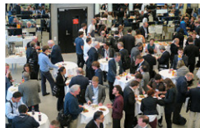
Conference delegates had many opportunities to both network and enjoy the history and culture of Bergen