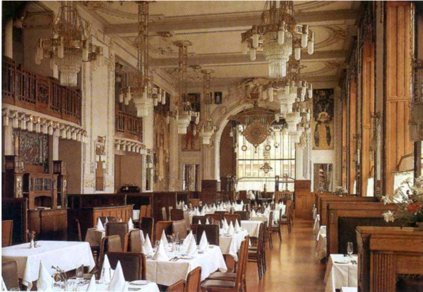
The French Restaurant in the Municipal House